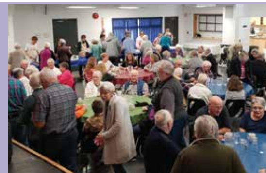
COWTOWN LUNCH BRUNCH, 2024.

The Southgate Community Fund awarded multiple Neighbourhood Small Grants (NSGs) in 2024. NSGs are grassroots grant making to support people making positive changes in their community. NSGs empower community members to bring their neighbours together, create new connections, and make their community a better place to live. This year, one of the NSGs went to support the Cowtown Lunch Brunch in Holstein. Students from Egremont Community School joined the Cowtown Lunch Brunch to perform Christmas songs and musical numbers from the Wizard of Oz. Wonderful intergenerational interactions could be seen between the seniors and students.