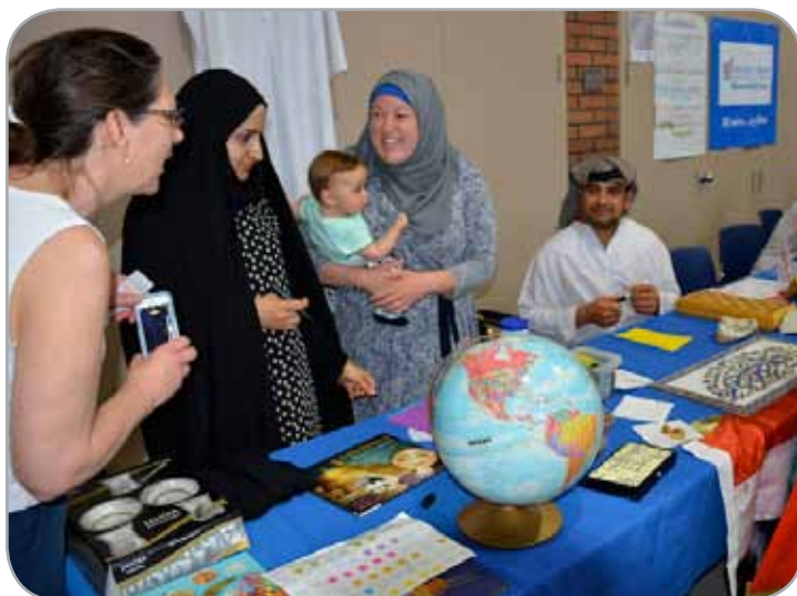
A grant to the Grey Bruce One World Festival celebrates the region's diversity — past, present and future