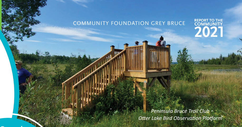
Peninsula Bruce Trail Club Otter Lake Bird Observation Platform