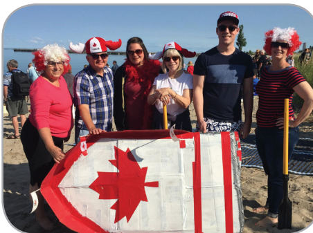
The Foundation team participated in the Kincardine Community Fund's Cardboard Boat Race in 2017.