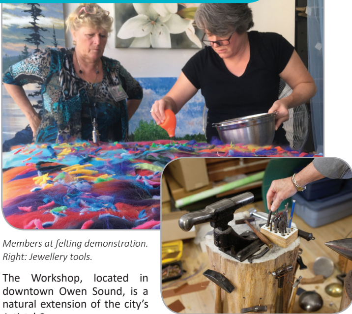
Members at felting demonstration. Right: Jewellery tools.

The Workshop, located in downtown Owen Sound, is a natural extension of the city's Artists' Co-op.