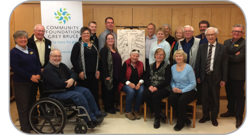
Ambassadors at Spring Forum in Port Elgin.

Reaching out across our region, the Community Foundation is served well by over 28 Ambassadors – former Board members and community leaders who continue to represent the Foundation in their areas. Over the past year we had two Ambassador Forums: in the fall we gathered at Wes for Youth Online in Walkerton then in the spring we met at the Port Elgin Public Library. These meetings are an important opportunity to gather together to network and discuss new topics in the world of community philanthropy.