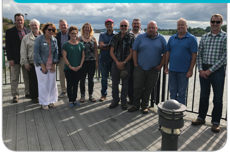
The Huron Basin working group gather on the Saginaw River in Bay City, MI.

Community Foundation Grey Bruce has joined 30 shoreline community foundations that will work across borders to drive progress on water challenges. It is a multi-year initiative supported by the Great Lakes Protection Fund and the Council of Michigan Foundations. Community Foundation Grey Bruce is one of 6 Canadian foundations participating in the project. The project will focus on engaging shoreline community foundations in collaborative working groups to advance a new era of water infrastructure management for the benefit of our ecosystems as well as the people and businesses that thrive around the Great Lakes. We look forward to sharing our Action Agenda with you in 2019.