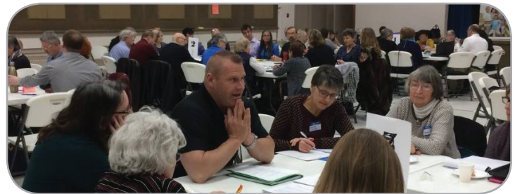
Participants at Spring Granting Fair, 2018.

Our Spring Granting Fair is another important event on the yearly calendar. Last year we had 7 funders available to meet and talk with over 120 reps from regional charities and non-profits. The speed-dating table rotations meant everyone met 5 of the funding bodies.