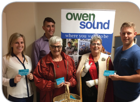
Owen Sound Community Fund celebrates Random Act of Kindness Day, November 2017.

boundary. Community Funds are managed by a volunteer advisory committee. These funds enrich the quality of life for the people of each municipality by supporting the good work of non-profits and charities.