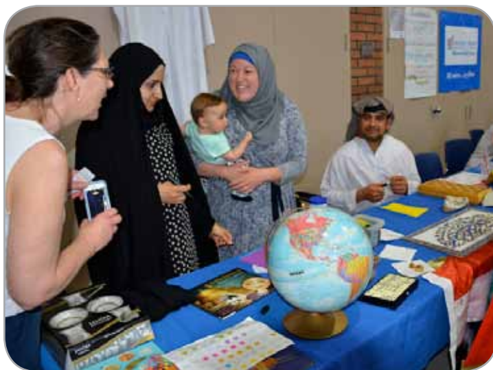
A grant to the Grey Bruce One World Festival celebrates the region's diversity — past, present and future