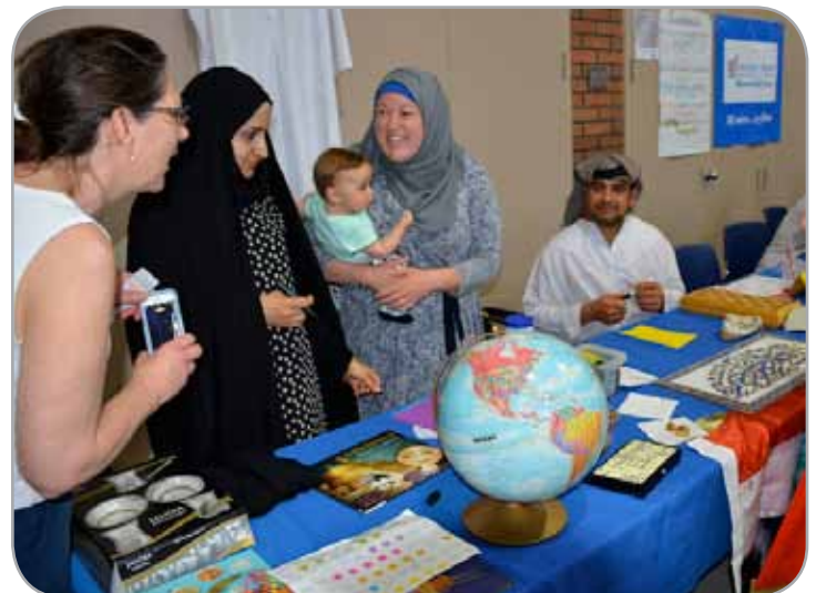
A grant to the Grey Bruce One World Festival celebrates the region's diversity — past, present and future

Bruce County Women's Institute Endowed Fund - provides scholarships supporting Bruce County students on their education pathway.