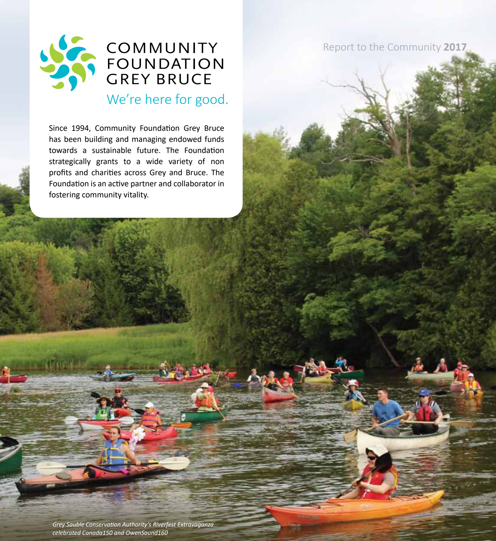
Grey Sauble Conservation Authority's Riverfest Extravaganza celebrated Canada150 and OwenSound160